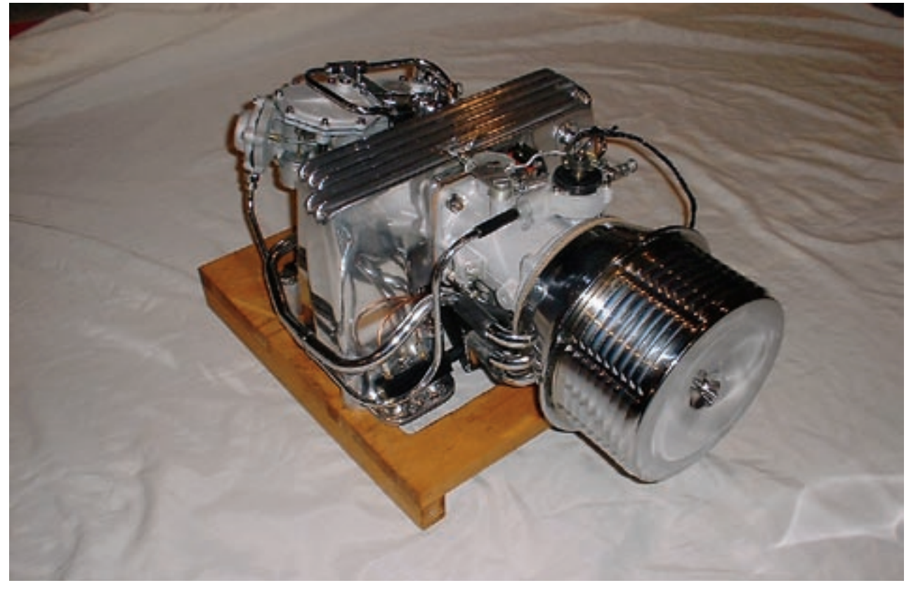
The very first unit, Serial number 1001, went appropriately to Harley Earl.

needed in each cylinder, very similar to the ignition distributor providing a timed spark to each cylinder.