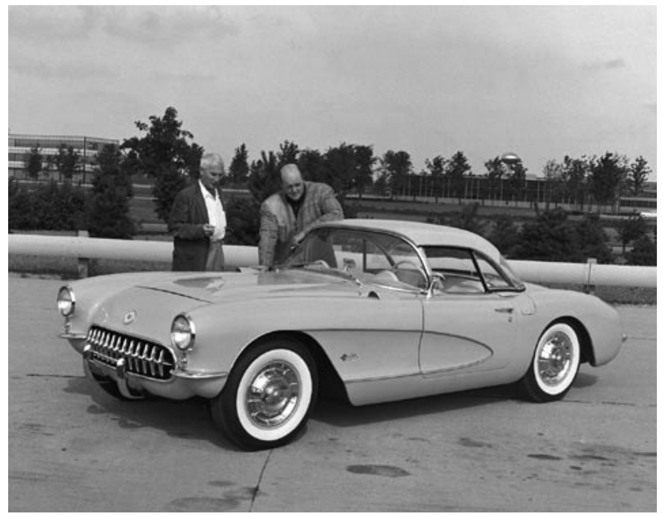
Zora Duntov proudly shows off the first production fuel-injected Corvette to Tom McCahill at the Chevrolet Engineering Center. The third Model 7014360, serial number 1003, went to Chevrolet Engineering, where it was mated up with the first hand-assembled RPO-579C (PN 3741697) fuel-injected 283hp V-8 engine, stamped F826EL. This car (E57S100010, a.k.a. number 10) was selected for a road test demonstration at the Long Lead Press Preview. It was re-fitted with this very special fuel-injection engine and is, thus, forever dubbed "The First Fuelie".