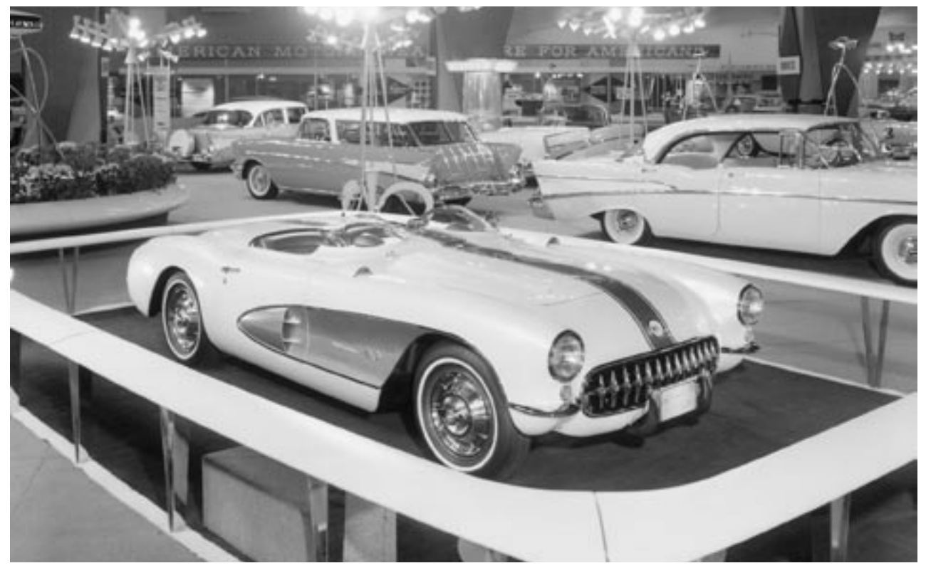
Earl eagerly assigned fuel-injection serial number 1001 to his styling staff for polishing and chrome plating befitting of the Corvette Super Sport show car for the New York Auto Show debut.

to the Rochester Products Division for mass production responsibility.